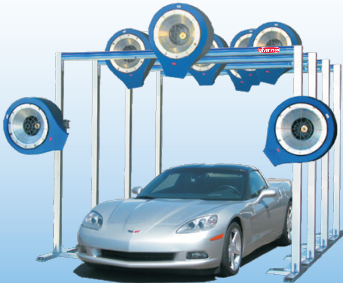
Shown with 4 arch frames and 8 nozzles.