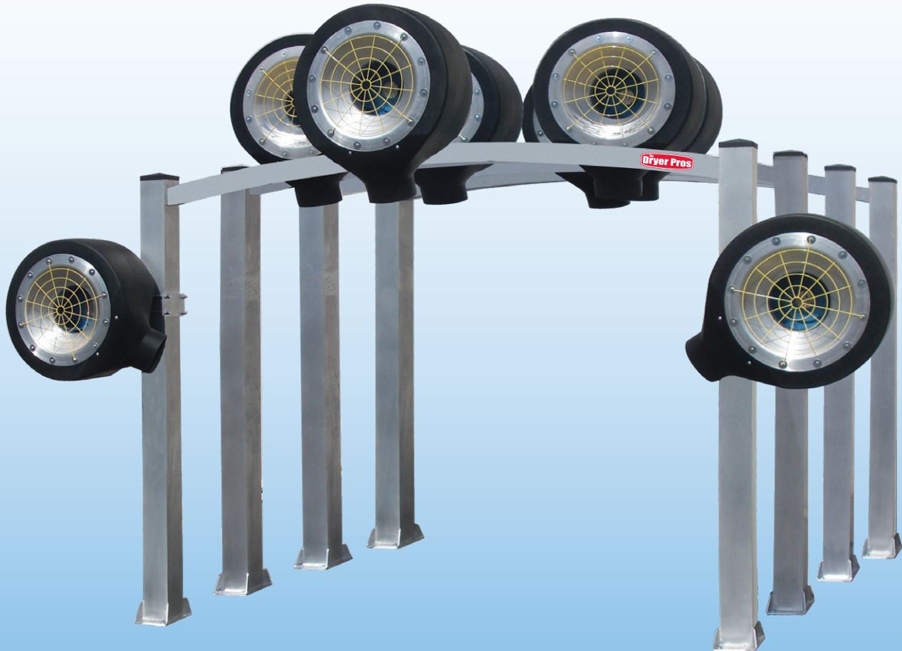
Shown with 4 arch frames and 8 nozzles.